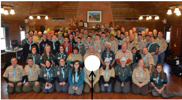
You belong here!

Youth (14-18) must have their Unit Leader's permission to participate and be confirmed by the Course Director.